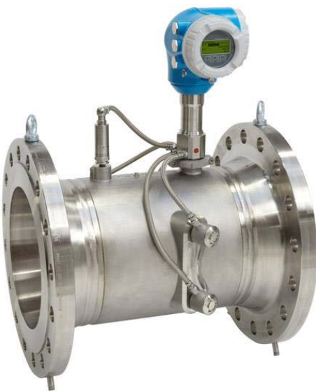
Fig. 1: The ultrasonic flowmeter device Proline Prosonic Flow G was developed for measuring even liquid gases and gas mixtures under fluctuating process conditions.