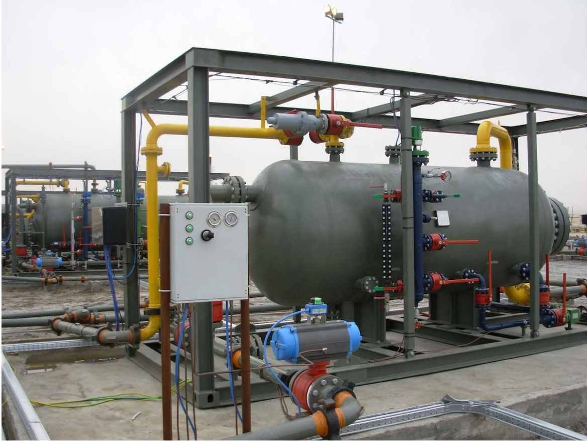
Fig. 3: The Proline Prosonic Flow G 300/500 offers a more precise and economic alternative to traditional upstream measuring procedures.

Mixtures emitting from a drill hole are anything but clean: In addition to solid particles, they tend to contain liquid oil and water. The first measuring point is located by the separator outlet which should contain these fractions, although a residual amount of fluid components often remains in the gas stream. Traditional measurement procedures such as differential pressure measurement using an orifice plate are primarily used nowadays under harsh conditions such as these. The issue is that this type of flow measurement is inaccurate and requires a lot of maintenance due to the wear-prone orifice.